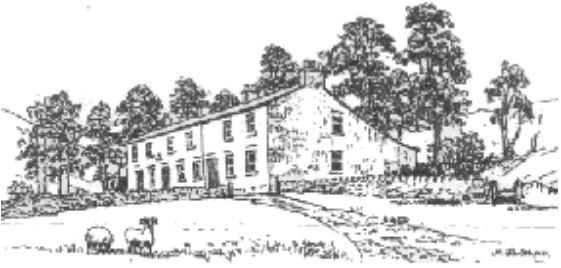
Skiddaw House www.skiddawhouse.co.uk